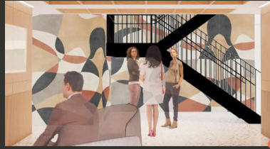
Stairwell framed with art & additional seating