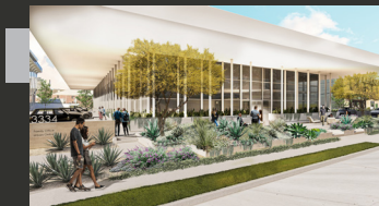
Covered & uncovered parking available