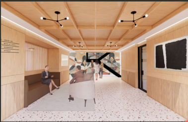
New coffee bar & refitted lobby